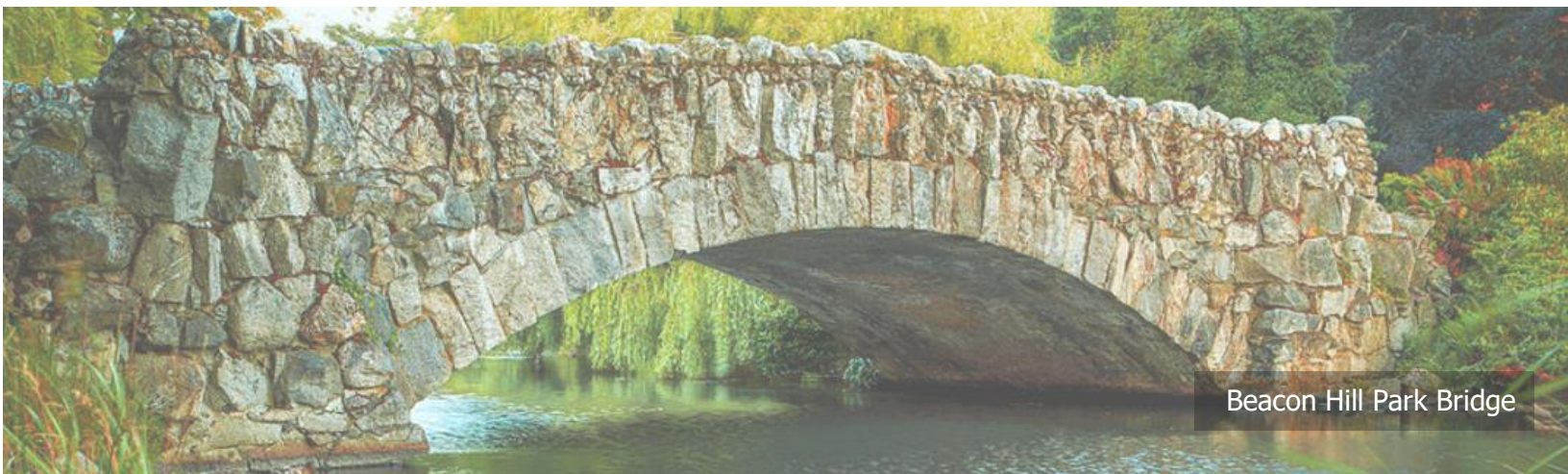
Beacon Hill Park Bridge

From production and audiovisual to meeting interpretation services to printing needs and more... your general sponsorship of our AGM ensures our meeting runs smoothly and everyone has a great time!