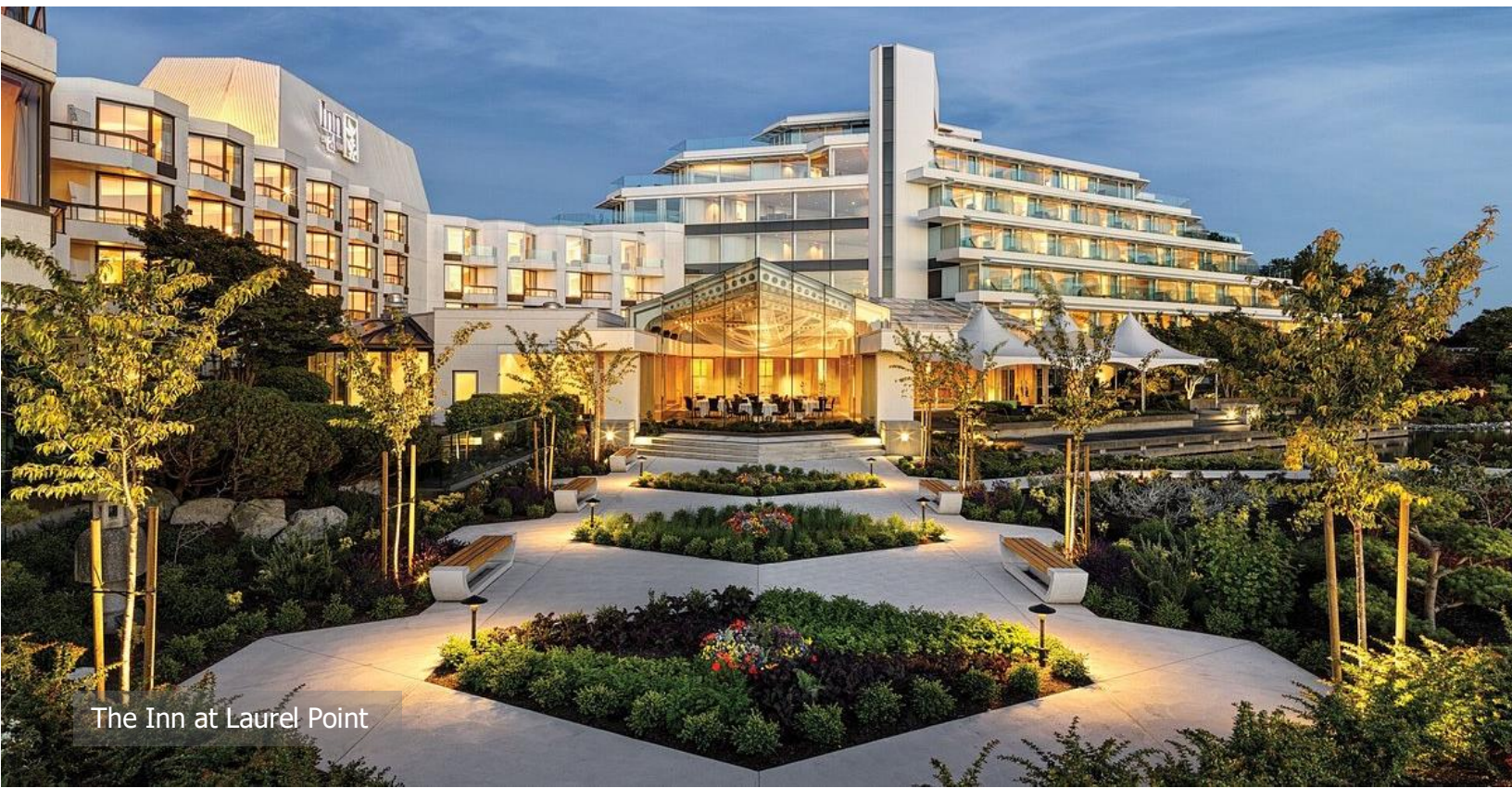
The Inn at Laurel Point

This year's AGM will be hosted at the beautiful Inn at Laurel Point, located at the entrance to Victoria's Inner Harbour on beautiful Laurel Point. With stunning views of the harbour and serene surroundings on the edge of the capital city, the Inn is a mix of ocean air and tranquil gardens to create a rare retreat in the city.