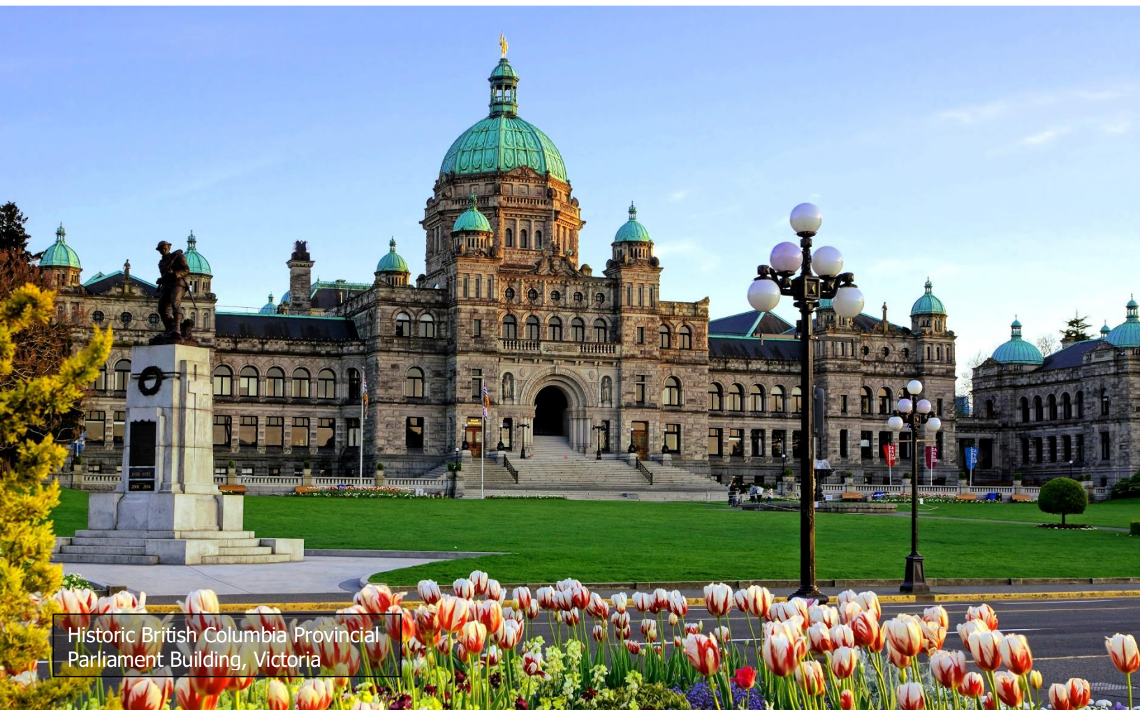
Historic British Columbia Provincial Parliament Building, Victoria

Victoria, British Columbia July 3-5, 2025