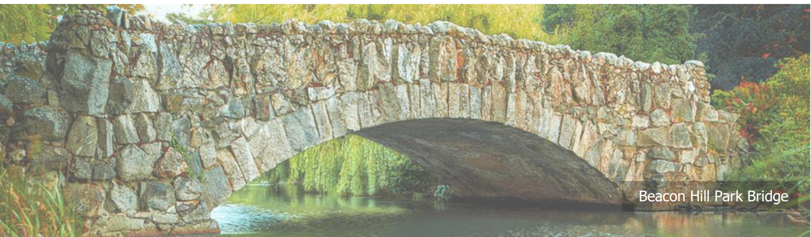
Beacon Hill Park Bridge

From production and audiovisual to meeting interpretation services to printing needs and more... your general sponsorship of our AGM ensures our meeting runs smoothly and everyone has a great time!