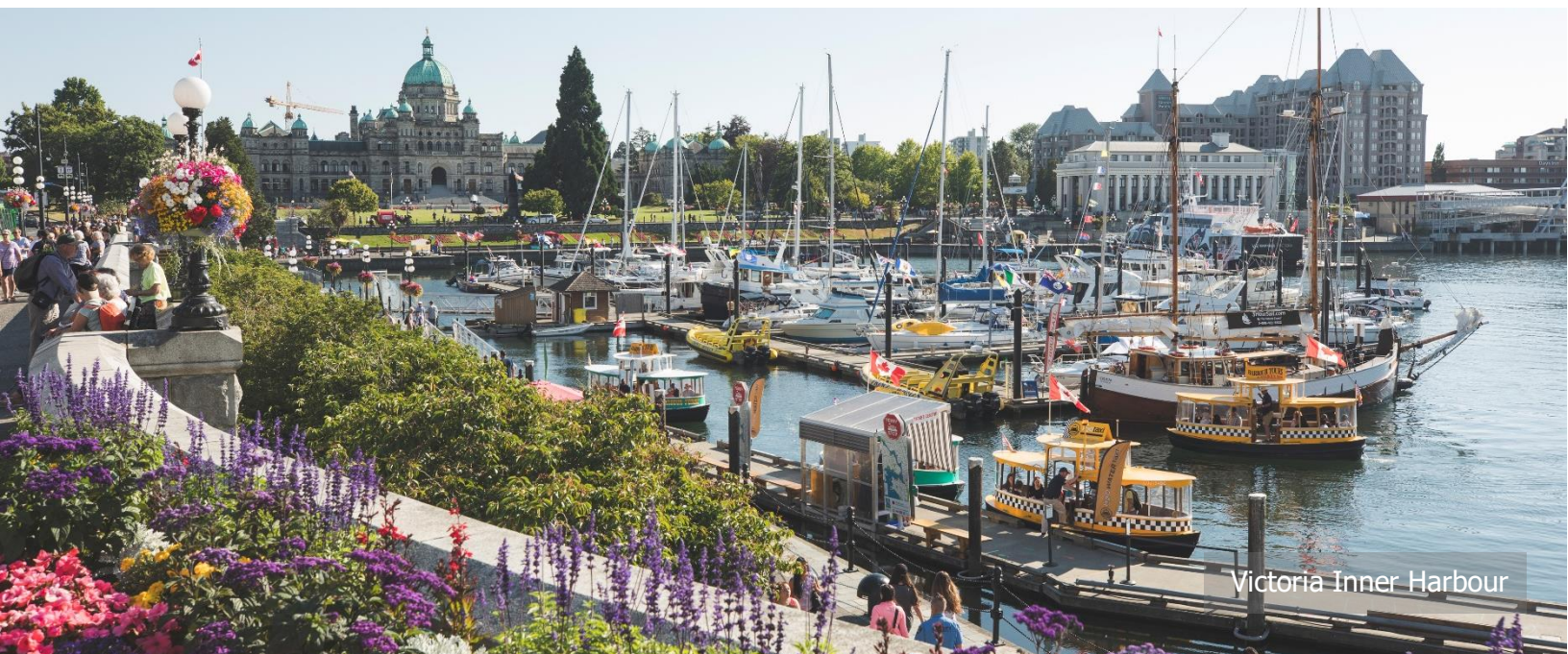
Victoria Inner Harbour

Please note: Sponsor packages are subject to change. Sponsors will be consulted prior to any changes.